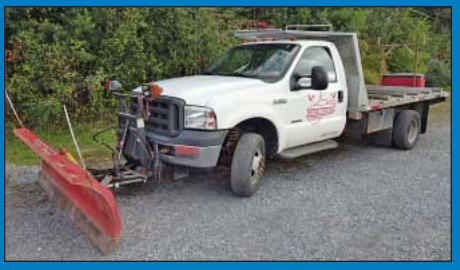
2005 Ford F350 Flat Bed Truck