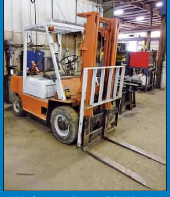
5,000 Lb. Komatsu Model FG25-8 LPG Solid Pneumatic Tire Lift Truck

Hydraulic Boom Crane Truck; 130,000 Miles, 30,000 Lb. RO Model 150-2 Crane Attachment; s/n 1921281029, 52' Reach