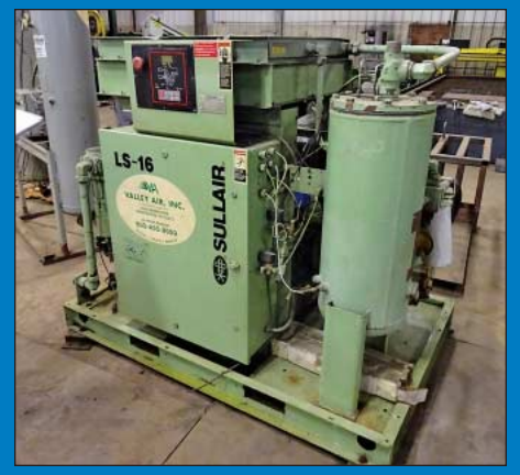
75-HP Sullair Model LS-16 Rotary Screw Air Compressor