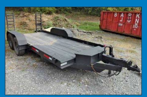
15' Tandem Axle Trailer with Ramps

Hand Tools, Ladders, Banding Outfits, Fans, Hoppers, Heavy Tables, Lawn Tractor and Related Items