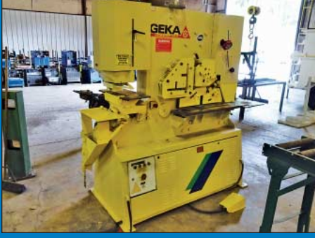
100 Ton Geka Hydracrop HYD-100 Hydraulic Power Ironworker