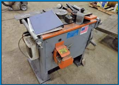
1" (#8) Fascut Model FR800-C Rotary Rebar Bender / Cutter