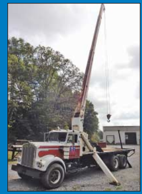
1987 Kenworth Model W900A Hydraulic Boom Crane Truck