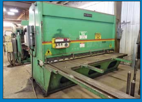
1/2" x 10' AccurShear Model 50010 Hydraulic Power Squaring Shear