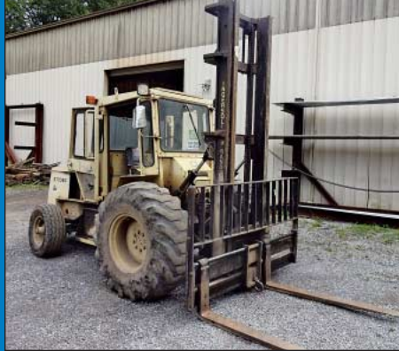
8,000 Lb. Ingersoll Rand Model RT708G Rough Terrain Yard Lift Truck

Office Equipment, Desks, File Cabinets, Chairs, Computer Equipment and Related