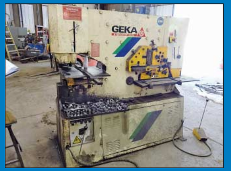
80 Ton Geka Hydracrop 80/SC HYD-80 Hydraulic Power Ironworker