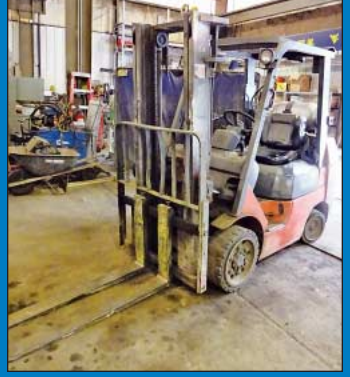
6,500 Lb. Toyota Model 7FGCU32 Solid Tire LPG Lift Truck